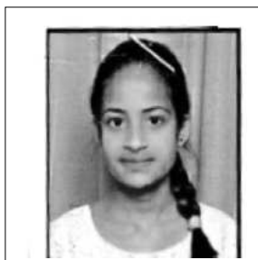
SWATI CLASS – B.Sc. CGPA – 8.17