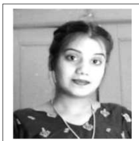
AASTHA CLASS – BBA CGPA – 7.70